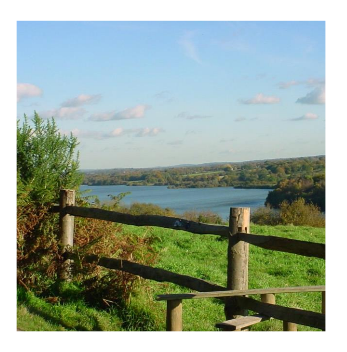
No. 3 'The Weirwood Walk'