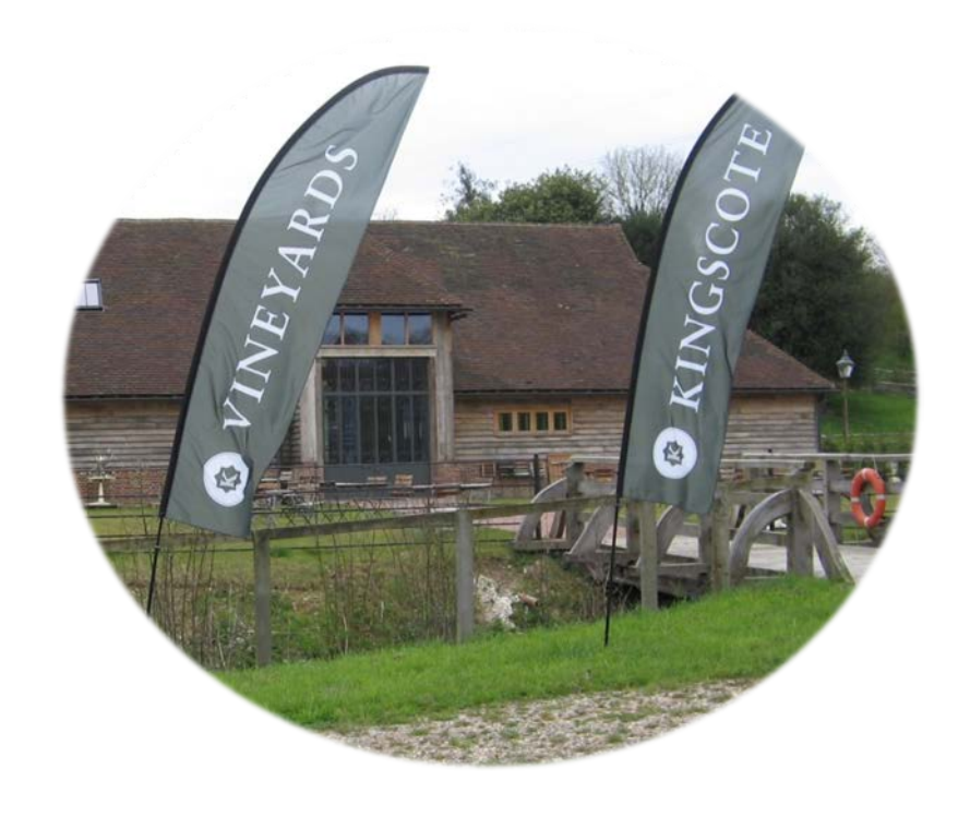
No. 5 'The Vineyard Walk'